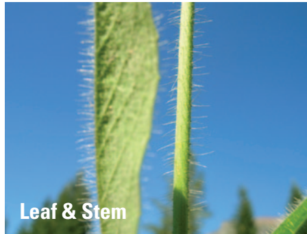
Leaf & Stem

Biological: The stolon-tip gall wasp Aulacidea subterminalis was first released in BC in 2011. Results are pending. 3