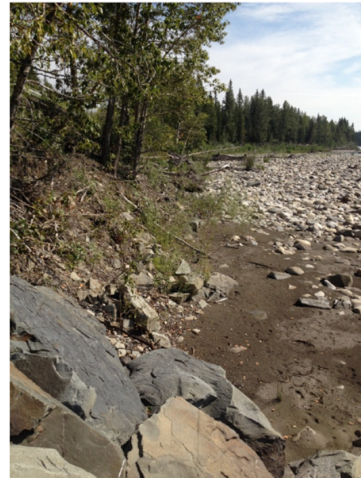
View of erosion damage and bank instability along the river bank adjacent to the Coal Camp Road looking downstream from the existing road bank armouring.